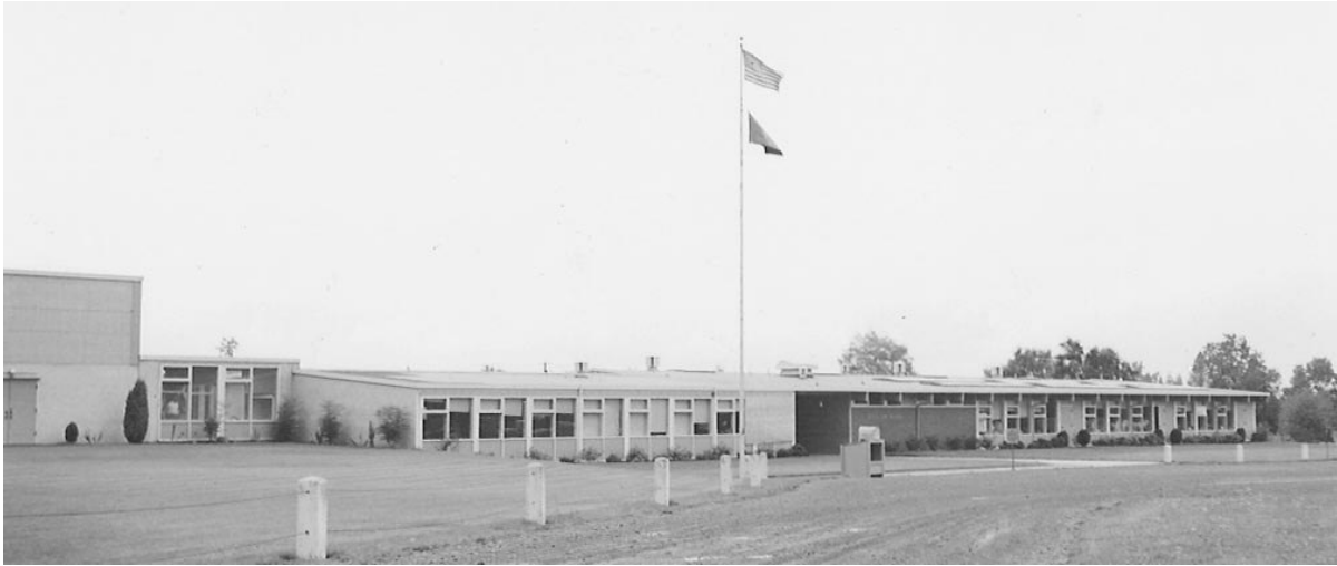
Seven Oak Middle School after significant additions in 1963.

Seven Oak Middle School came about because of the consolidation of two school districts. With the upper floor of their two-story school condemned, and with student populations growing, Waterloo School District consolidated with Crowfoot School District in 1952. A new school was built at Waterloo that year, and in 1955 Seven Oak School was completed to house the district's seventh and eighth grade students.