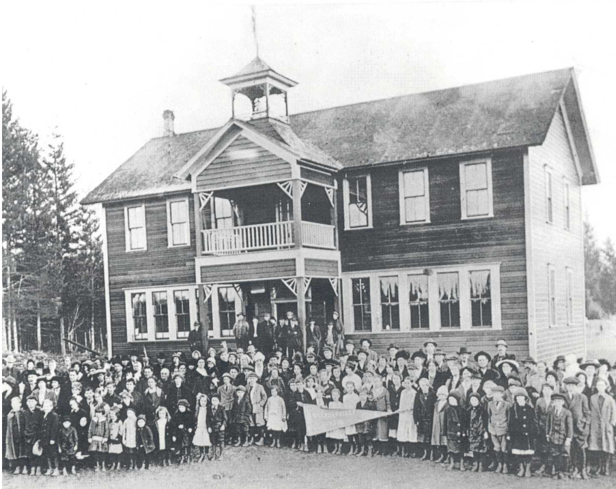
Waterloo School and the community it served. Date of photo unknown, unfortunately.

In 1995 the Crowfoot District, which included Waterloo School, unified with other surrounding districts to become a part of Lebanon Community School District. During this period it served students in kindergarten through the second grade. Waterloo School was closed at the end of the 2001-02 academic year (June 12, 2002). Students now attend Hamilton Creek, Riverview or Cascades School, depending upon where they live. See the Crowfoot School history for additional information.