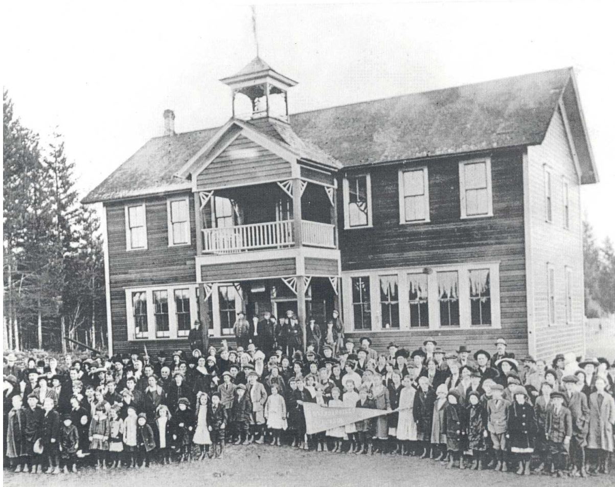
Waterloo School and the community it served. Date of photo unknown, unfortunately.

In 1995 the Crowfoot District, which included Waterloo School, unified with other surrounding districts to become a part of Lebanon Community School District. During this period it served students in kindergarten through the second grade. Waterloo School was closed at the end of the 2001-02 academic year (June 12, 2002). Students now attend Hamilton Creek, Riverview or Cascades School, depending upon where they live. See the Crowfoot School history for additional information.