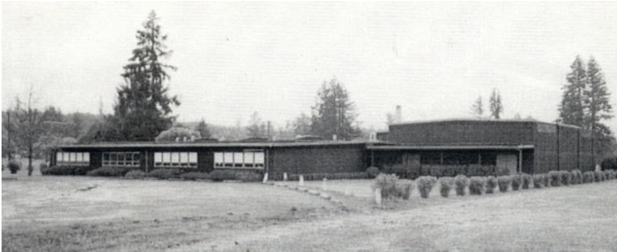
"Two views of the new Waterloo school, probably taken shortly after its construction in 1951. This school served the community for 50 years before it was closed in 2002."